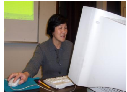
Students demonstrate their new technology skills in class presentations.