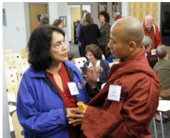
Civil rights activist Dolores Huerta meets human rights activist Kovida U at the EC !