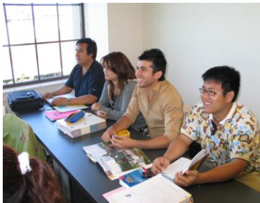
Students are diverse in age, language, and educational background.