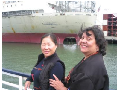
The Harbor Tour introduces students to the Port of Oakland on a class fieldtrip.