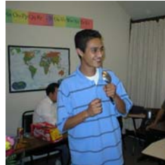
Men & Women alike study at ECIW

planning to continue their education and all are preparing for successful careers!