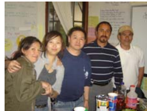
Students at one of ECIW’s famous class parties

English Center. Several times each session there are class and school parties. You will learn about American holidays and taste foods from around the world. Often, your class will go on field trips to local museums and other interesting locations. Below this article is just a sample of what it’s like to be a student learning at The English Center.