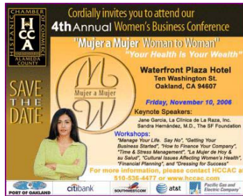
Mujer a Mujer: Woman to Woman, the Hispanic Chamber of Commerce's Annual Event

On November 10 th , fourteen advanced level students and two staff members joined hundreds of local businesswomen at the 4 th Annual Business Women's Conference, Mujer a Mujer – Woman to Woman , held at the Oakland Waterfront Plaza Hotel and sponsored by the Hispanic Chamber of Commerce. The ECIW atten-