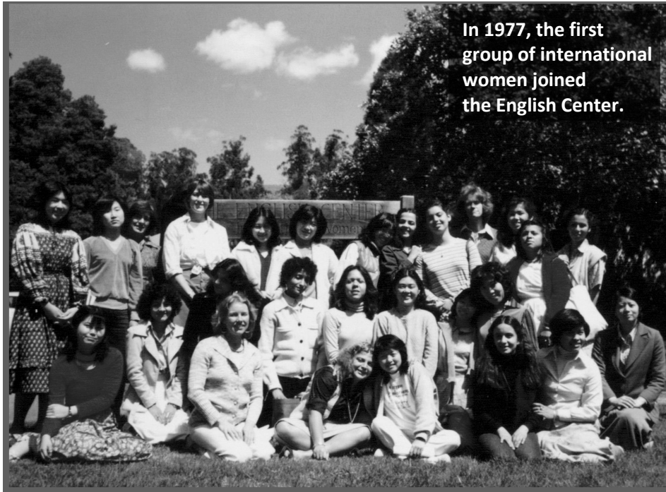
In 1977, the first group of international women joined the English Center.