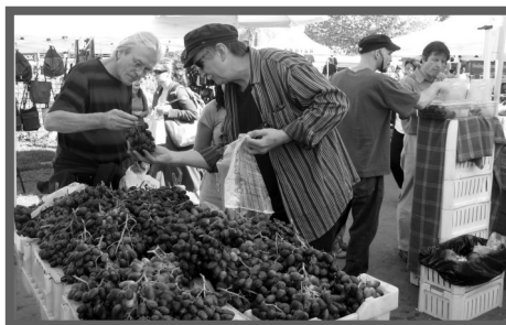
Two shoppers select grapes during Oakland's Old Farmers' Market on Ninth St.