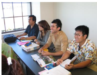
Students are diverse in age, language, and educational background.