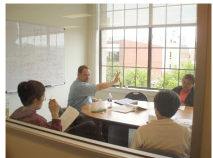
Career workshops prepare students for the English-speaking workplace.