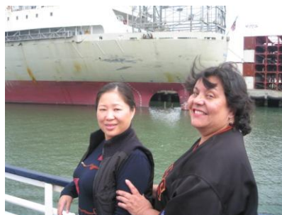
The Harbor Tour introduces students to the Port of Oakland on a class fieldtrip.