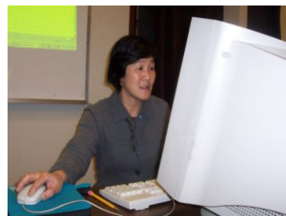
Students demonstrate their new technology skills in class presentations.